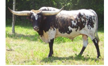
Horseshoe J Charm